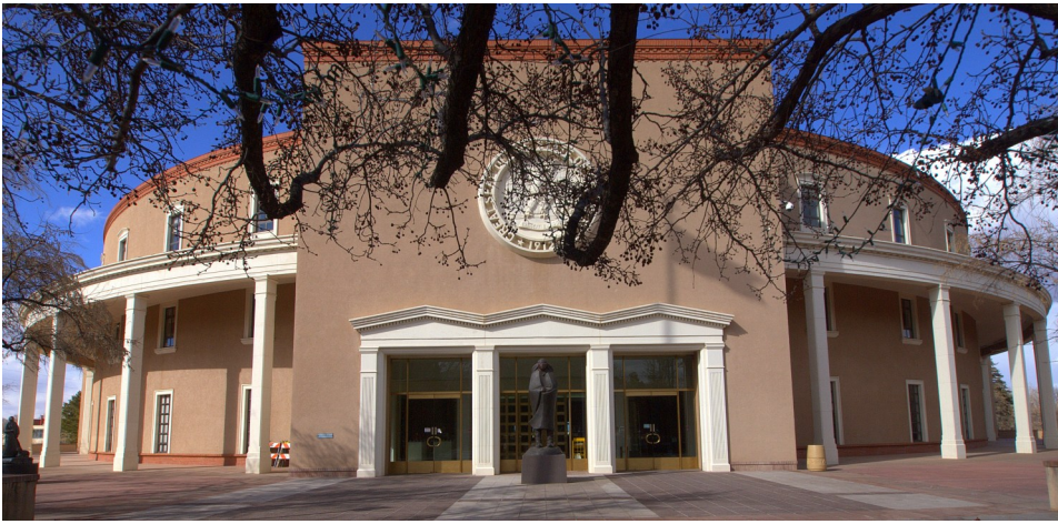
New Mexico State Capitol