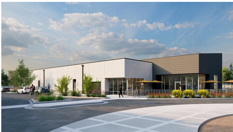
A rendering of MaxQ@Kirtland