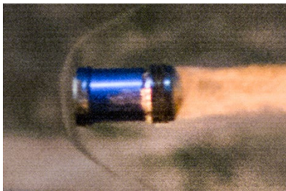
Image processing Digital streak images Participant applications Hands-on finale