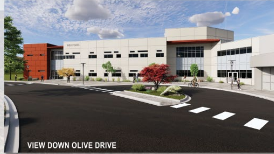
VIEW DOWN OLIVE DRIVE