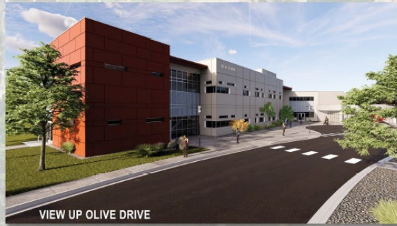
VIEW UP OLIVE DRIVE