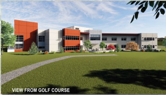
VIEW FROM GOLF COURSE