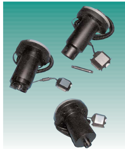
▲ 2525-800 series load cell

Instron load cells are tested for accuracy and repeatability on a calibration apparatus traceable to international standards, with an uncertainty of measurements not exceeding one third of the permissible error of the load cell. Accuracy has been found to be equal to or better than 0.025% of the load cell rated output or 0.25% of the indicated load, whichever is greater.