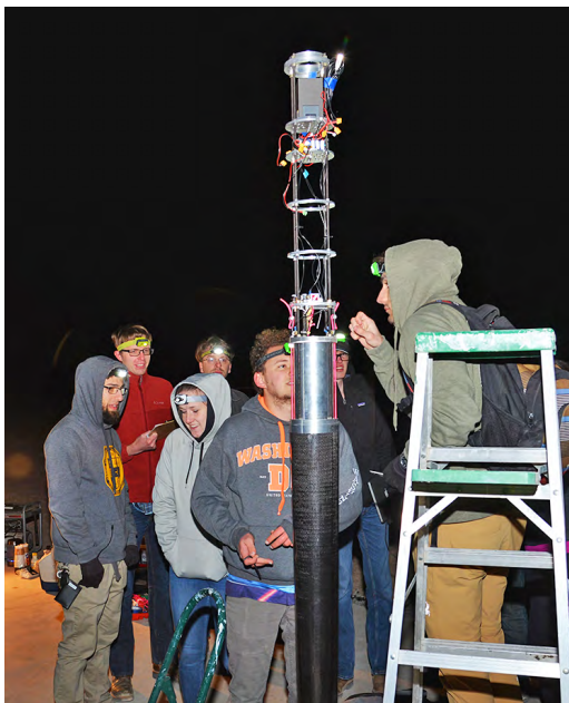
Predawn rocket launch assembly, 2018

My memories of my experiences during the two years of Junior / Senior