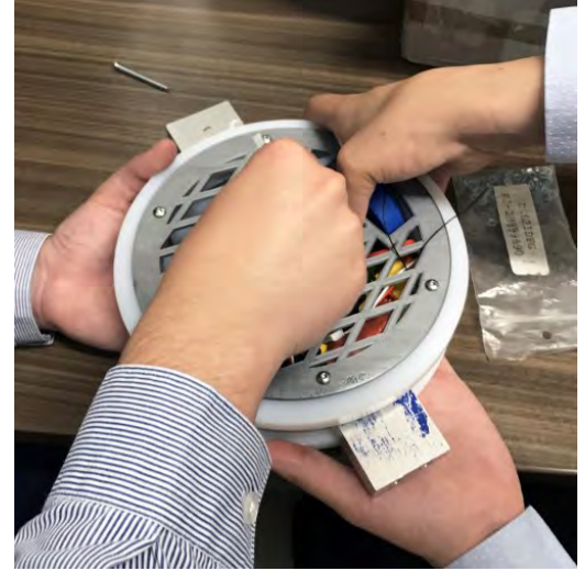
Battlebot assembly, 2019

Junior and Senior capstone courses at New Mexico Tech set our graduates apart. Employers value the many skills NMT alumni gain through these programs, especially teamwork, communication, research and design, and creative and critical thinking.